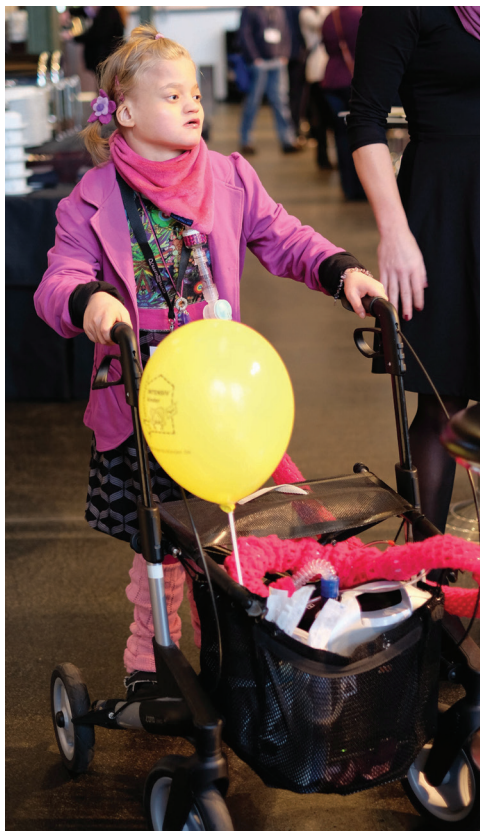
Celine on an outing with her Astral.

*Internal battery plus two external batteries