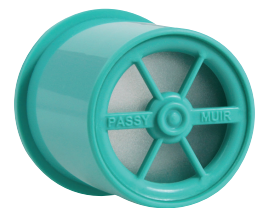
PMV® 007 (Aqua Color™)

The Passy-Muir® Swallowing and Speaking Valve is the only speaking valve that is FDA indicated for ventilator application. It provides short and long term pediatric and adult tracheostomized or mechanically ventilated patients the opportunity to produce uninterrupted speech. By restoring communication and offering the additional unique clinical benefits of improved swallow, secretion control, oxygenation, and weaning, the Passy-Muir Valve has improved the quality of life of mechanically ventilated patients for over 25 years.